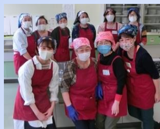
The staff and volunteers in the cafeteria