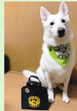
“Kira” wearing a bandana

More than 200 dogs have been registered with the council. The registered dogs wear a bandana and take a walk with their owner patrolling the streets.