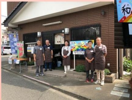
Staff members of the house