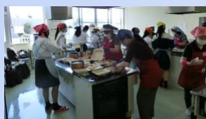
Sagamitana High School students preparing the food for the cafeteria