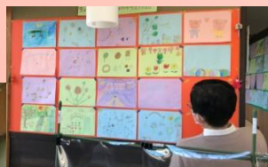
Place mats made by Tana Elementary School students