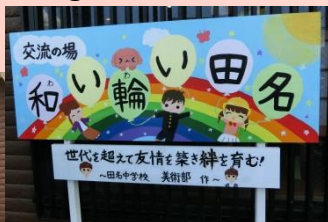
Board created by the art club of Sagami Tana High School students

The place was established on August 2021 as the place where local people can freely come and chat with the neighbors.