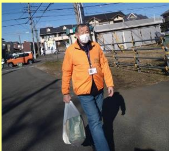
Taking out the garbage

The center started in 2010 to help people in the community with daily needs.