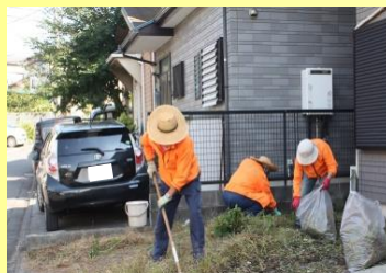
Cleaning the garden