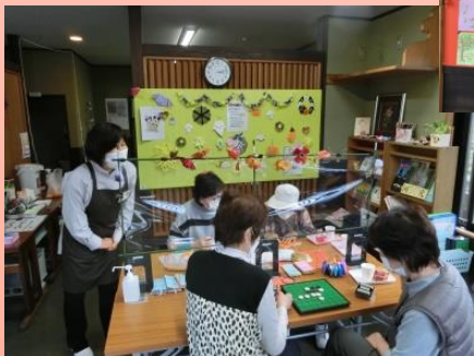
Guests can enjoy playing Japanese chess, shogi or go and making origami