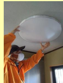
Changing the light bulb