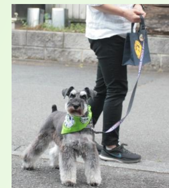
“Kai” is patrolling around the streets in Shioda area

Contact: Office of Tana Council of Social Welfare Phone number: 042-713-3690